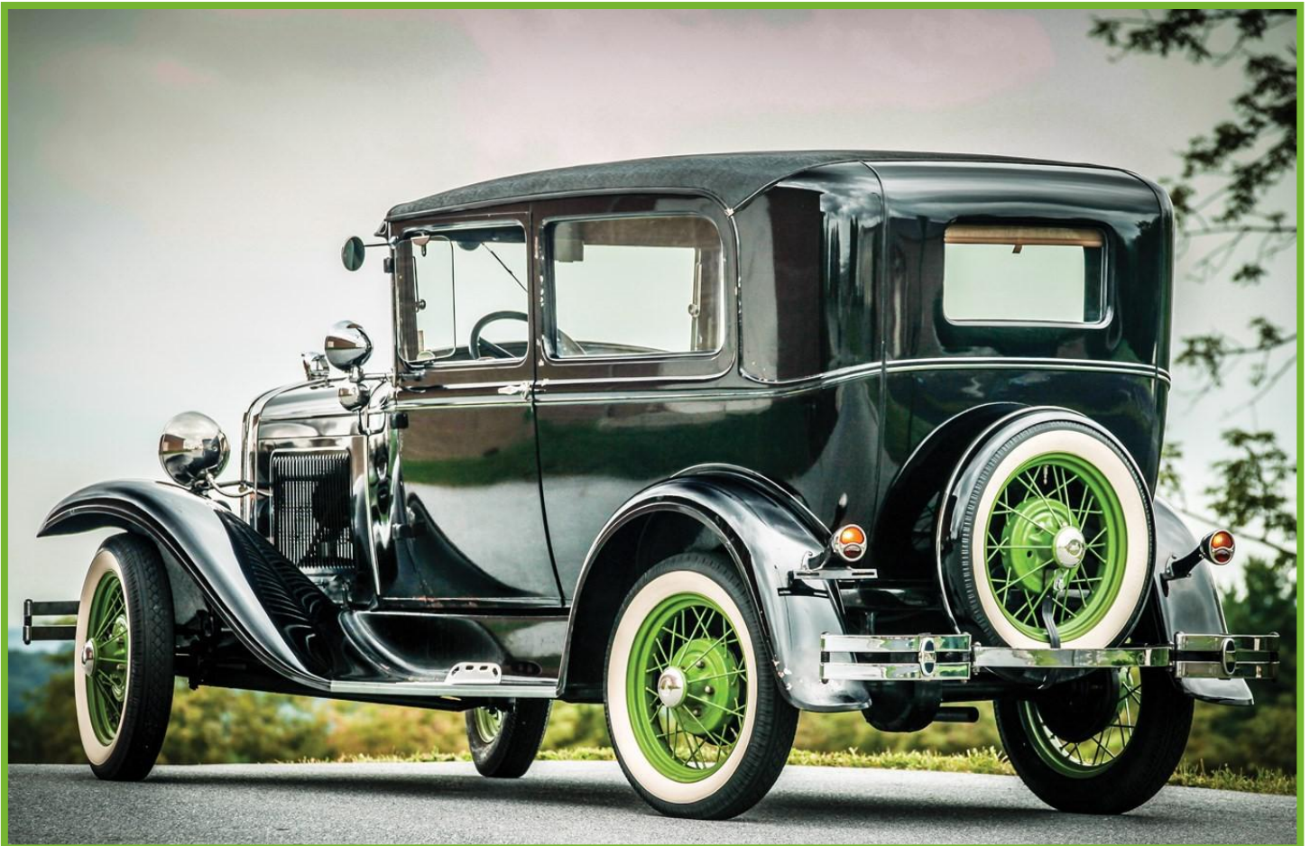
A pretty Tudor Sedan with Apple Green wheels.

The official newsletter of Beaver Chapter Model A Ford Club of America, Portland Oregon Volume 57, Issue 9