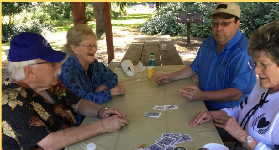
Thanks to the Henderson's for picking up the chicken and setting up for the picnic.