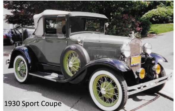
1930 Sport Coupe

1931 Tudor, frame up restoration, very nice car $15,500 Bill Griffith, Bill46Grif@aol.com or 503.320.2668