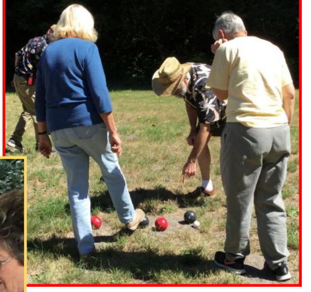
Thanks to the Henderson's for picking up the chicken and setting up for the picnic.