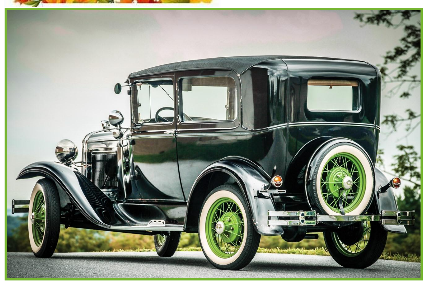
A pretty Tudor Sedan with Apple Green wheels.

The official newsletter of Beaver Chapter Model A Ford Club of America, Portland Oregon Volume 57, Issue 9