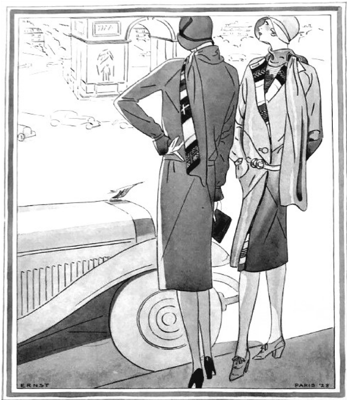
Coat from LEDA