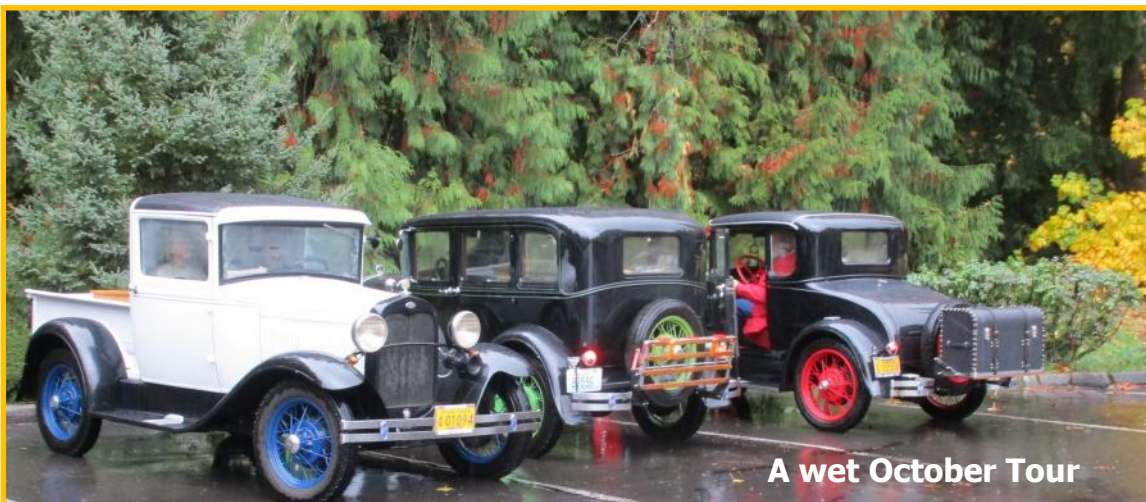
A wet October Tour