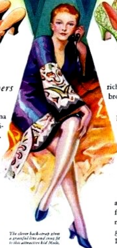
The clever back-strap gives a graceful line and snug fit to this attractive kid Mule.

Daniel Green, slipper maker to the world for 47 years, offers this captivating array—gleaming satins,