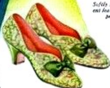
A velvet bow provides a smart finish to this embroidered satin bridge slipper.

in these glorious slippers by Daniel Green