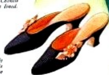
The femininity of this crepe de chine Mule is enhanced by a crepe flower ornament.