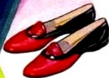
Softly padded, this patent leather and kid slipper spells ease.