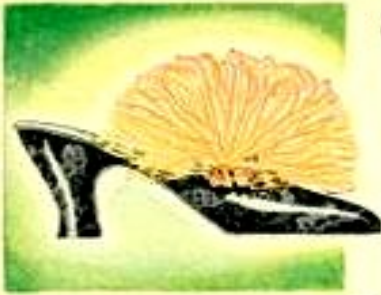
An Ostrich quill adds a supremely feminine note to this brocaded satin shoe.