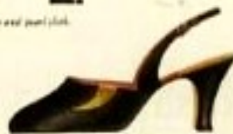
For you same looking won't hang in stock.

• Say to your toes: "Come on, toes! Let's get practical. Let's decide which of these Daniel Green slippers we must have. Shall we get the Sandpiper for outdoor lounging? Or do we need silk ones for Bridge time first? What about color? Are you partial to a match or a contrast note? Whatever you decide suits me. Daniel Green slippers are smart either way. Too bad we can't have every slipper Daniel Green makes! But we'll see to it that Daniel Green makes every slipper we have. No one . . . anywhere . . . ever did a better job."