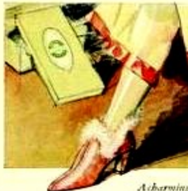
A charming winter version of the Pajama Boot in

"A charming winter version of the Pajama Boot in brocaded silk and white fur.