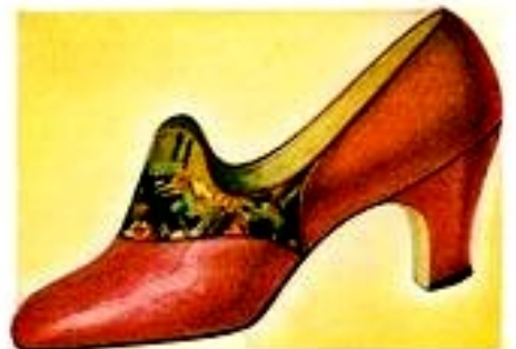
This new Hostess Slipper is charmingly different. In bright leather with Paisley brocade insert, it is vibrant with color.