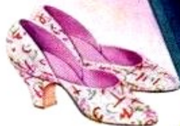
This D'Orsay is done in a gay, imported Chinese print. Silk-crepe lined.