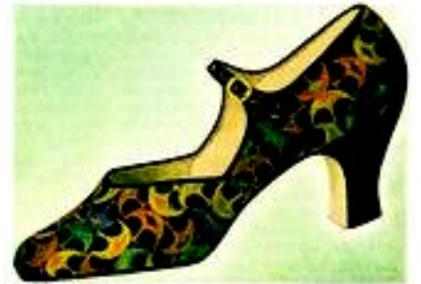
A striking embroidered one-strap harmonizes with many costumes and has a wide variety of uses.