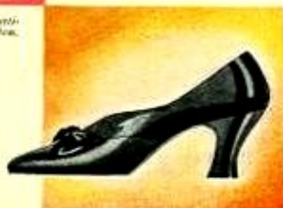
The three graceful lines of this Bridal slipper will flutter even the most demure fan. A soft velvet bow lends a charming touch to this crepe de chine and satin model.

You will recognize DANIEL GREEN Slippers in the smartest shops and stores by their distinctive sole-mark which guarantees perfect fit as well as style-brilliance.