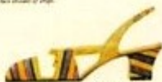
This is the Sandpiper—the London Trade.