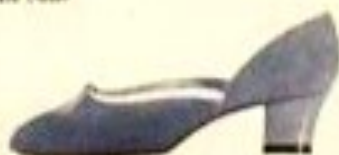
A soft silk Tuff is cute and just dink.