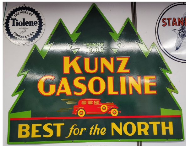
One of the cool things about being in a Model A club is getting to see something like this.