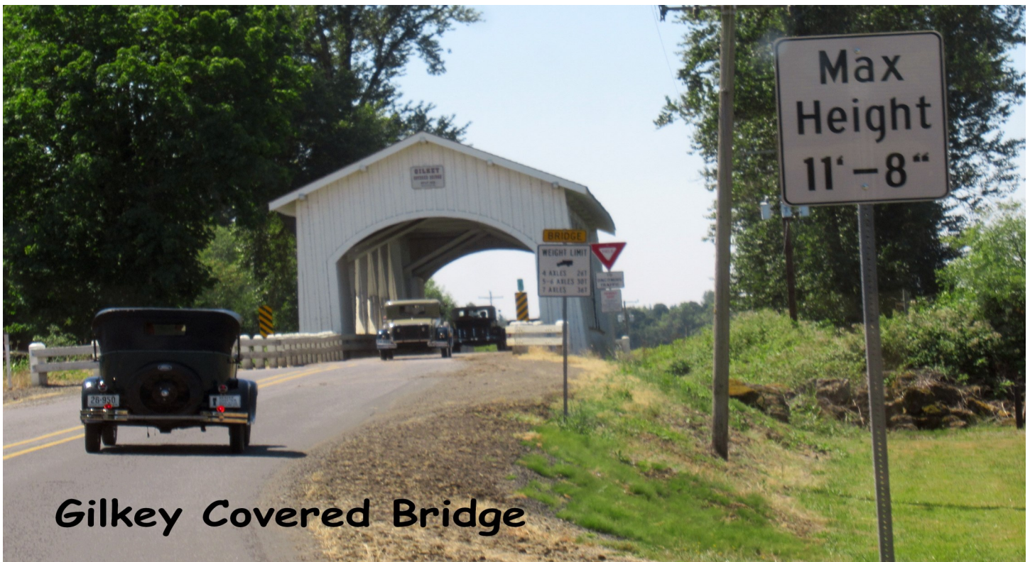
Gilkey Covered Bridge