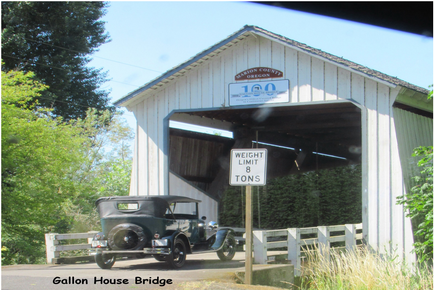
Gallon House Bridge