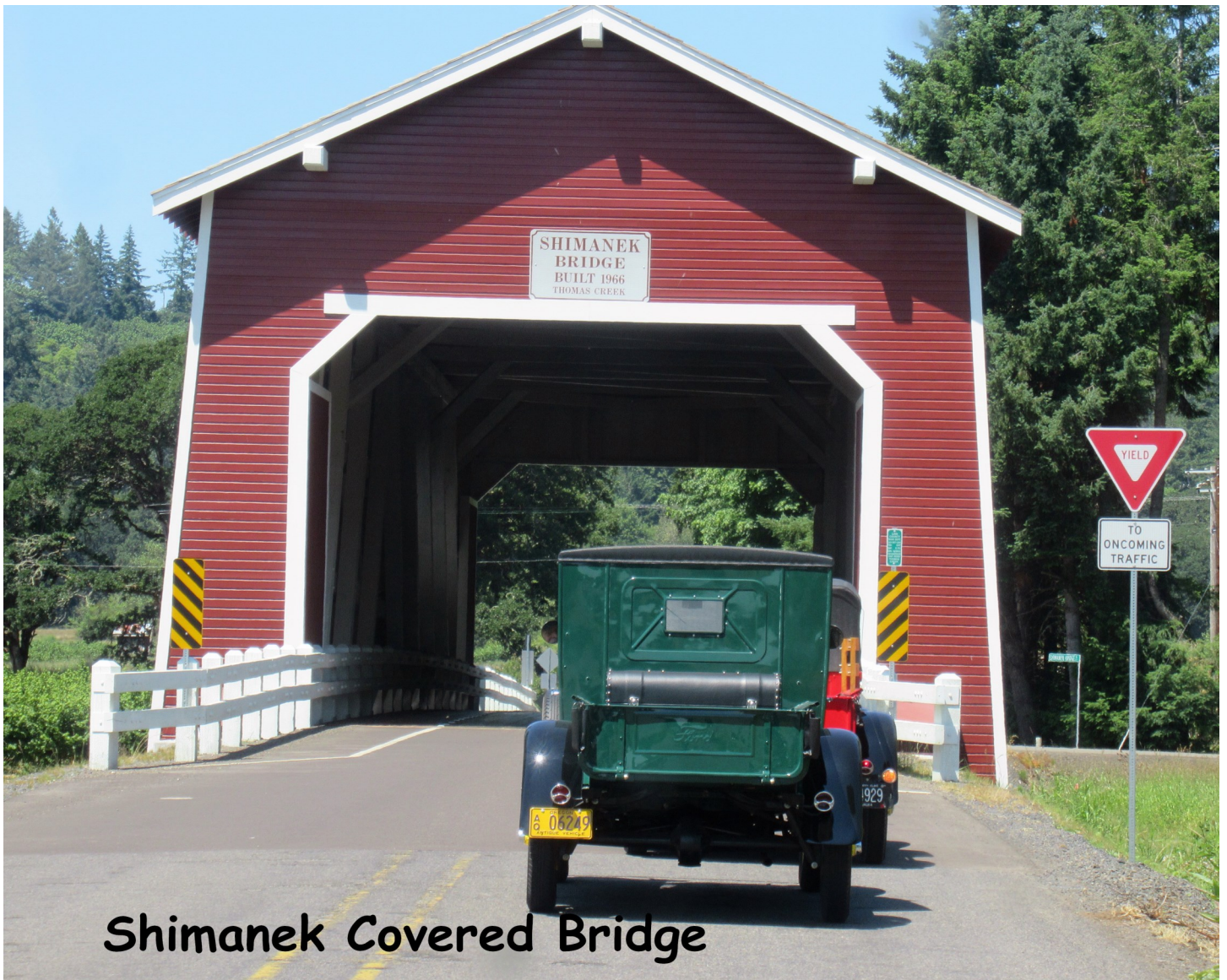
Shimanek Covered Bridge