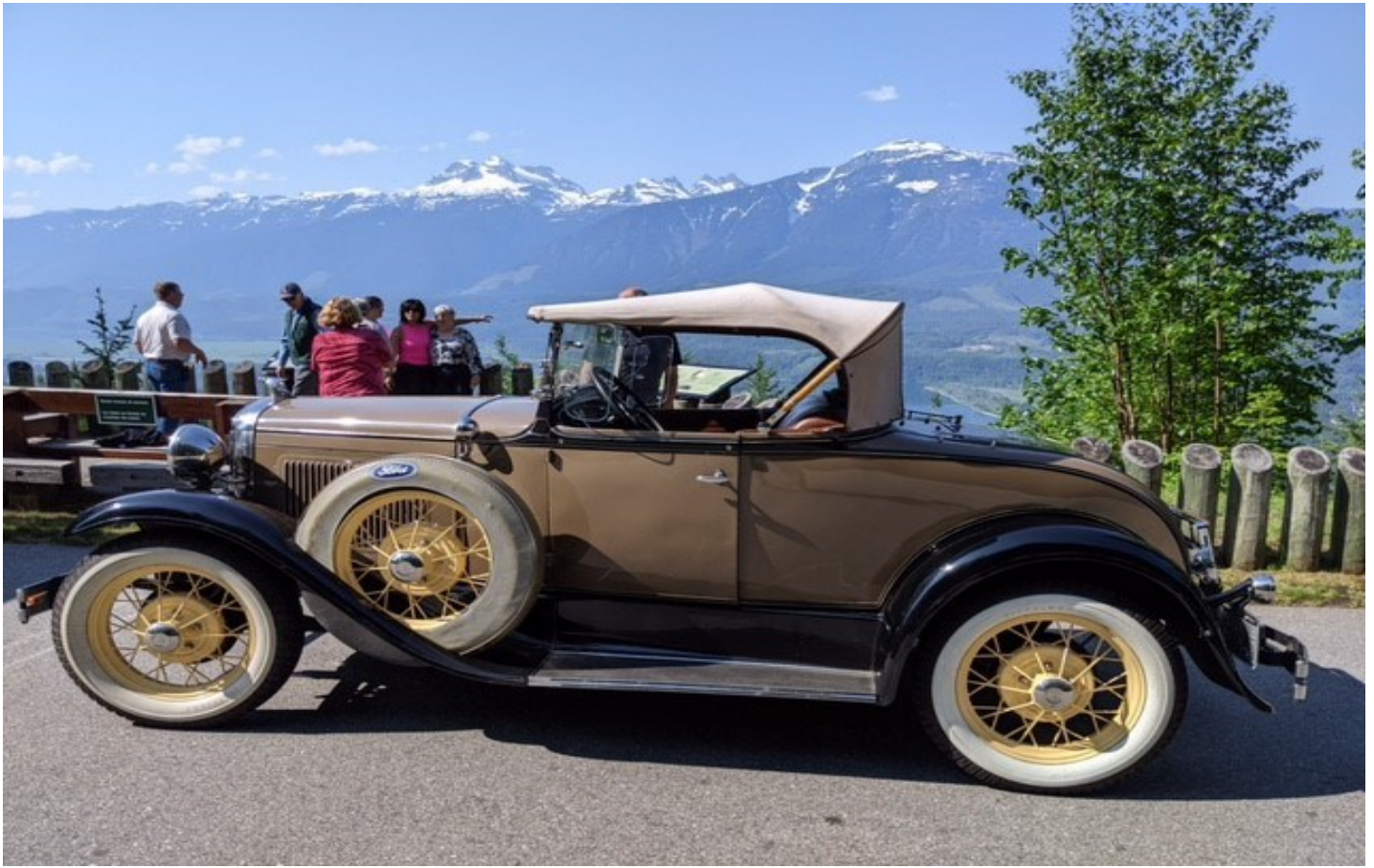
Only real problem solved (below) My Revelstoke National Park (above)