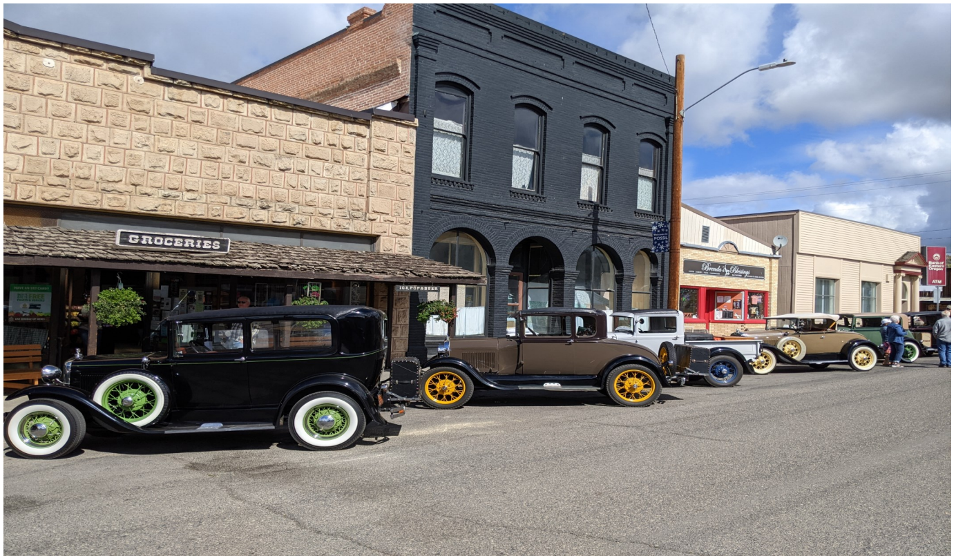
HOTEL IN FOSSIL (Ghost Town/Oregon Rural Roads Tour)

The official newsletter of Beaver Chapter Model A Ford Club of America, Portland, Oregon