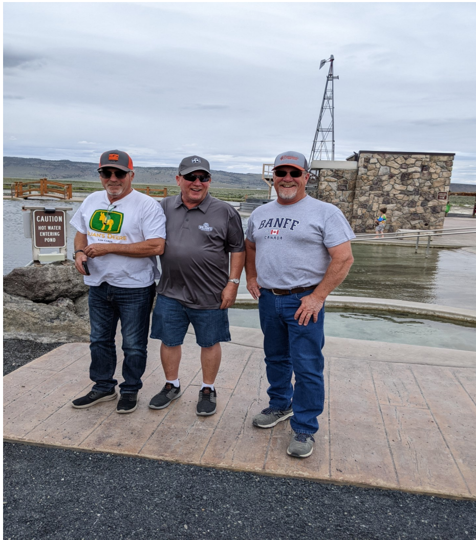
Crystal Hot Springs (above) Ochico primitive roads (below)