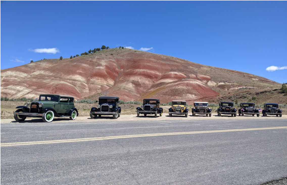
SILVER CITY, IDAHO