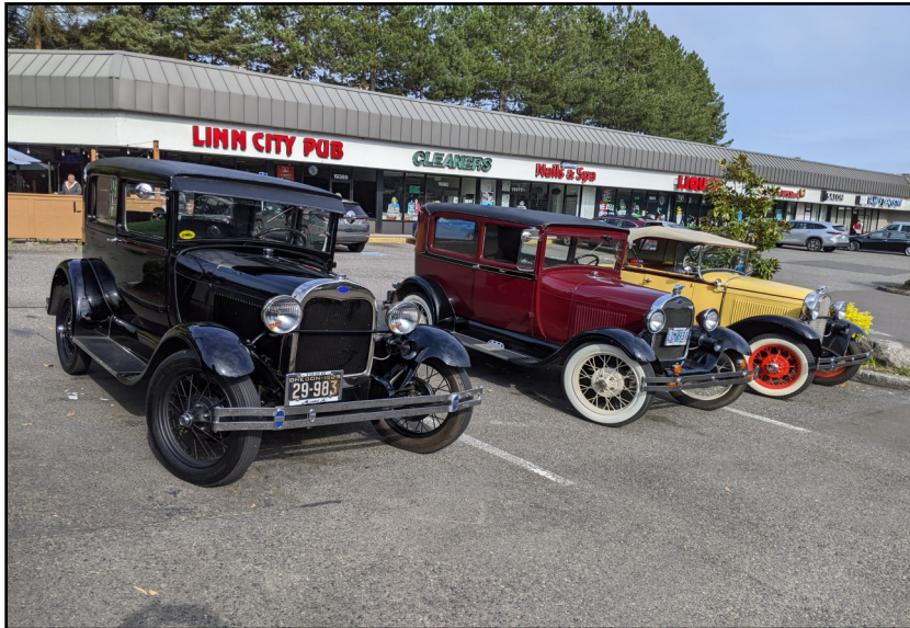
Breakfast at the Linn City Pub on May 3