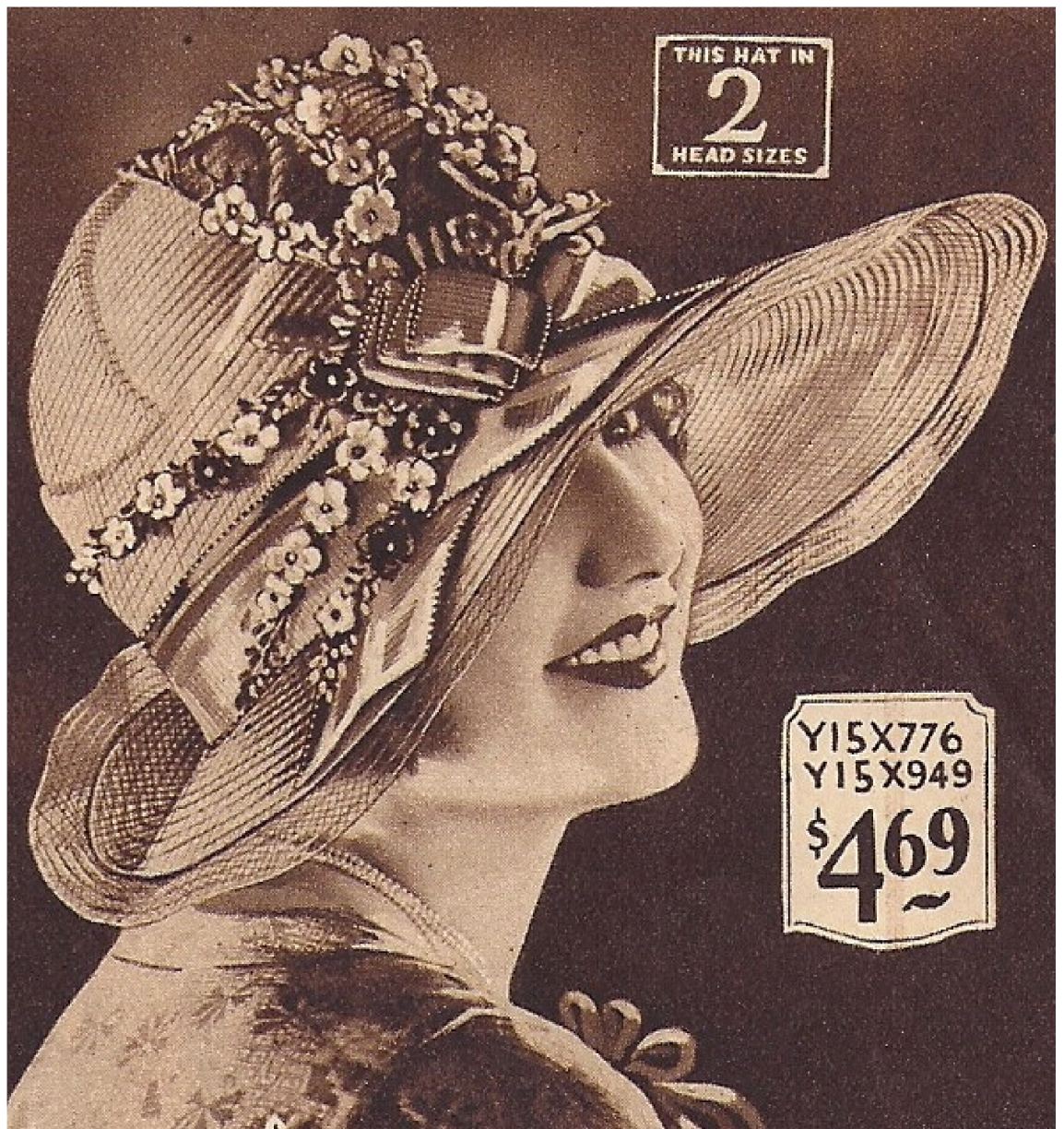
1928 Model A Hat

This is a typical example of a large brim hat that was worn during the early years of Model A fashions.