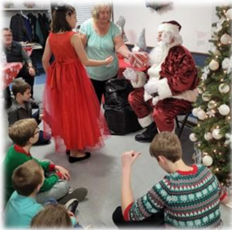
Santa even made an appearance...