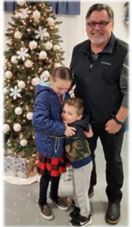
Gnome Sweet Gnome