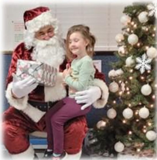
Kids of all ages enjoyed seeing Santa!