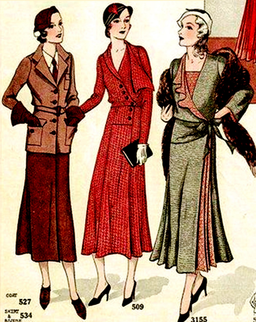
COAT 527 SKIRT & BELT 534