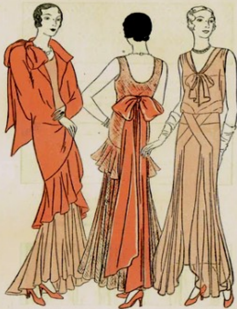
Cape 3186 Frock 3144

BUTTERICK PATTERNS ARE FIRST IN STYLE IMPORTANCE AND FIRST IN SERVICE TO YOU