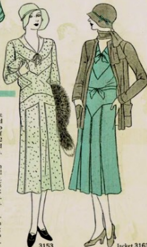
3153 Bag 3131

3153—A chic wool frock. In 32 to 38 (sizes 14 to 20) and 40 to 44 bust. 3131—Bag. One size. For 36, frock 2\frac{3}{4} yards 54, with \frac{1}{2} yard 32; bag \frac{3}{8} yard 27 or more. Frock, 45 Cts.; Bag, 35 Cts.