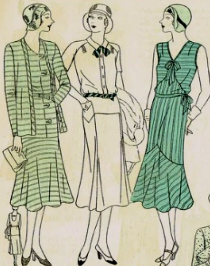
3151 Bag 3131