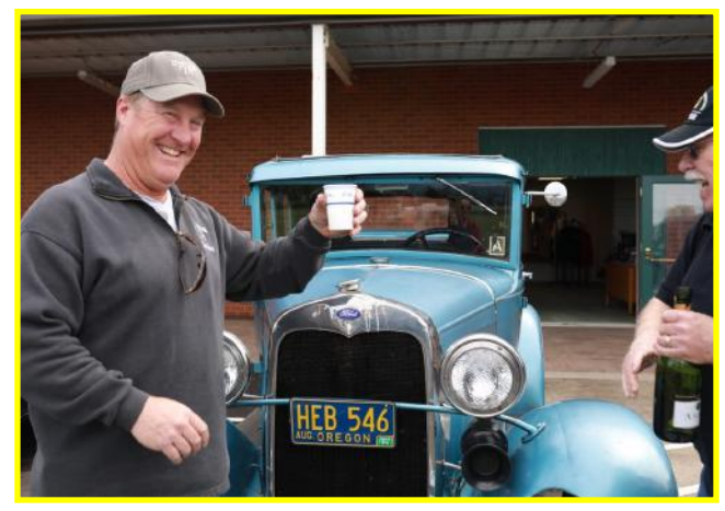
Two more pictures from the May Tour