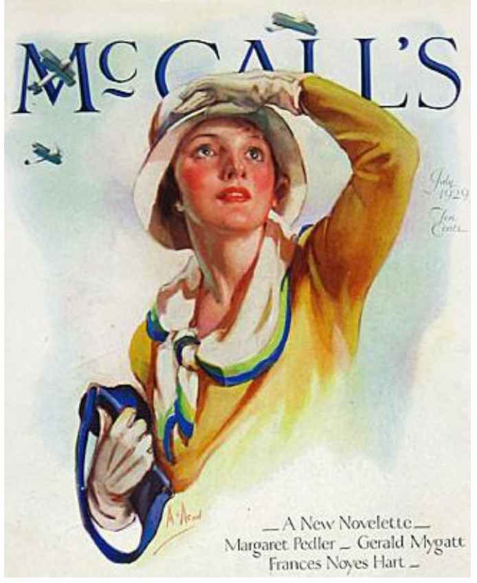
These are two front covers from 1929 magazines

Of course the asymmetrical cloche hat matches the outfit perfectly. We don't have the advantage today of going shopping and purchasing a complete Model A era outfit. Usually we find pieces here and there and it may even take years to find all the articles. If you can sew, it would be easier to put together a complete era looking outfit! ~Jeanie Adair