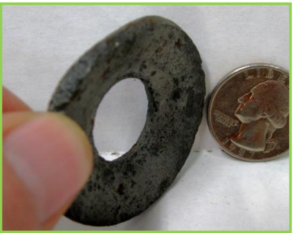
Mystery Model A Part

Never let someone with the significance of a speed bump become a roadblock in your life.